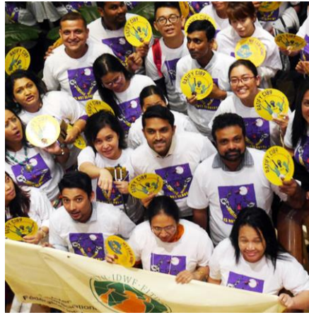
Asia: IDWF-MFA Domestic Workers Conference: Enhancing collective advocacy, action and empowerment of domestic workers in Manila, October 22-24 >>>