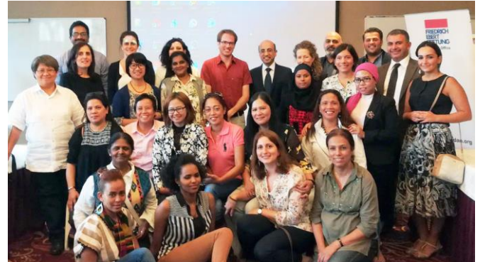
Middle East & North Africa: In partnership with the FES, LO-Norway, national trade unions and others, the IDWF gathered domestic workers leaders and other social partners to discuss concrete suggestions to address rights gaps of migrant domestic workers in the region >>>