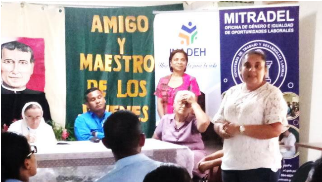
Latin America: UPACP, Argentina took the lead in building alliances and synergies among Governments and Domestic Workers in the region through the meetings in Panama, August 16 and Paraguay, September 12 >>>