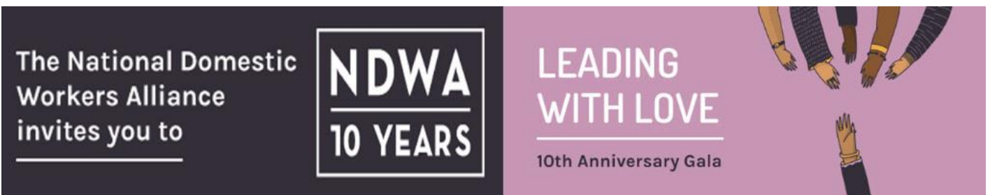
North America: NDWA 10th Anniversary - Over the course of a decade, the National Domestic Workers Alliance has emerged as the leading, unified national voice for dignity and fairness for domestic workers in the USA >>>