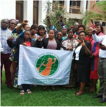
Africa: IDWF Training of Trainers Workshop on "Planning" was held in Kigali, Rwanda, October 22-26 >>>