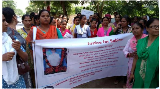
Asia / India: Domestic workers union seeks justice for a minor domestic worker who was raped and murdered. After more than a year, the fight is still on.