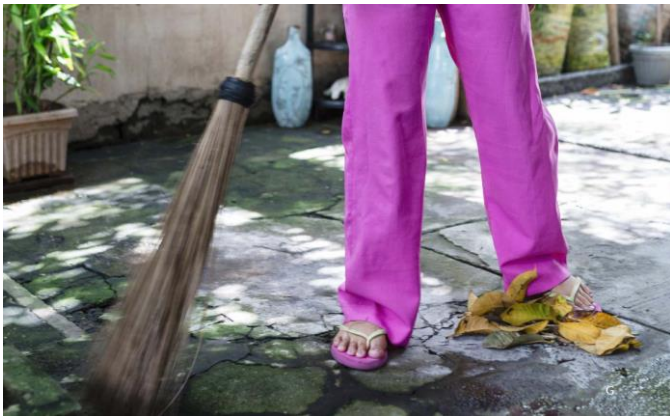
Asia: International guidelines are one path to push for decent living and working conditions of migrants - Report on the Asia Regional Consultation on the UN Compact on Migration.