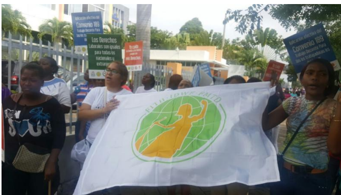
Latin America / Dominican Republic: Campaigning for implementation of