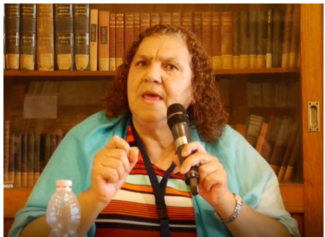
Europe / Italy: IDWF members led by