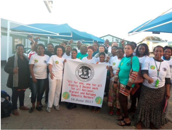
Africa / Namibia: NDAWU Shop-stewards training began with a march to commemorate the International Domestic Workers Day